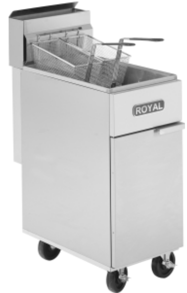
RFT-50 Shown On Optional Casters