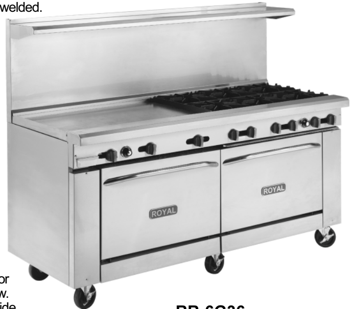
RR-6G36 Shown With Optional Casters